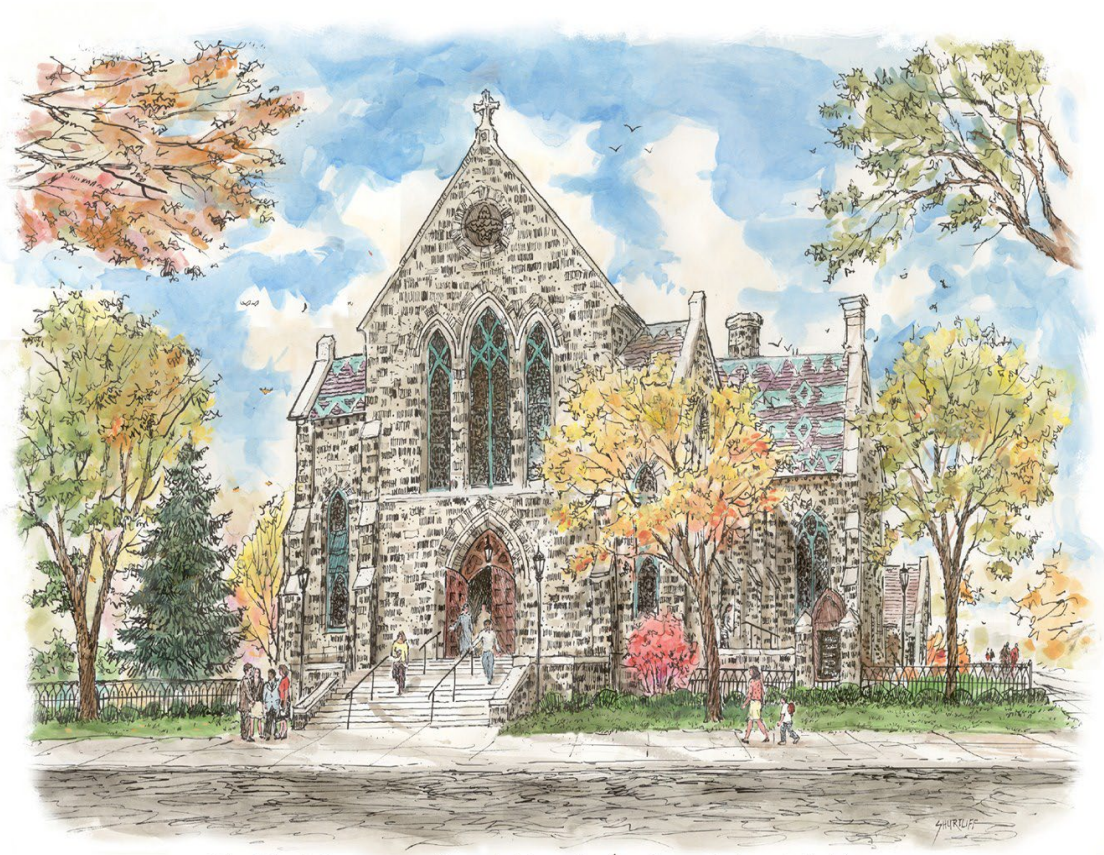
The First Congregational Church & Ann Arbor, Michigan

Whatever Your Story, You're Welcome Here